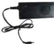
20 Battery Charger