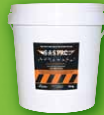
SAS PRO Fipronil non-repellent granular ant treatment