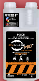
EnsnarePRO 50 SC non-repellent residual insecticide