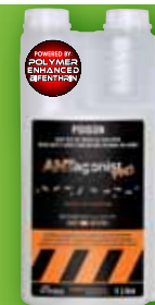
ANtagonistPRO Polymer Enhanced residual insecticide