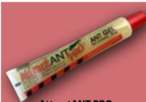
AttractANT PRO Ant Bait Gel