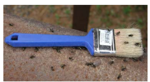
Even this paintbrush which had been left in the bucket of bait granules was effective in attracting and killing flies.

The unique potency of the attractant blend coupled with fast knockdown activity of imidacloprid makes this a deadly combination for flies.